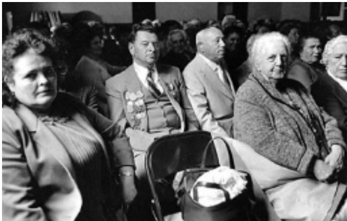
"Strategizing" Ira Nowinski Collection, from the series Soviet Jews in San Francisco. Stanford University Libraries, Department of Special Collections)

In 2002, the Stanford University Libraries acquired 15,000 negatives, 1,200 study prints, and over 600 archival prints from three extensive series of photographs taken by Ira Nowinski, mainly during the mid- and late 1980s: